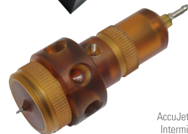
AccuJet Single-Point Intermittent Nozzle