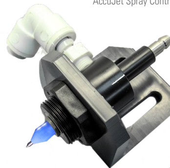
AccuJet Single-Point Continuous Nozzle