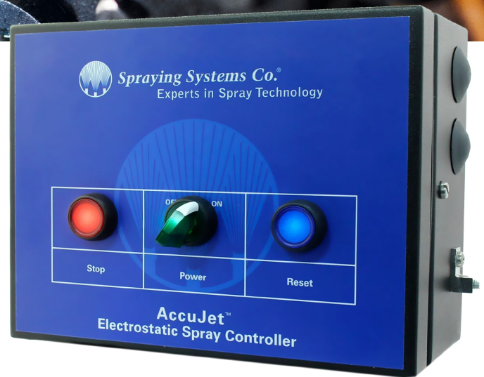
AccuJet Spray Controller